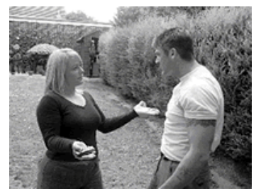
As always, keep the aggressor at bay with your fence.

talking in exclamation. From here we explode forward with exactly the same motion as for the double slap {Thunder clap} only this time we are adding the top edge of the phone to strike one side of the head whilst simultaneously slapping the other side of the head with the other hand.