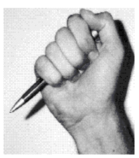
The hammer grip applied to the mobile and the pen.