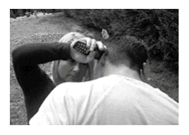
"What, you want this?" BANG